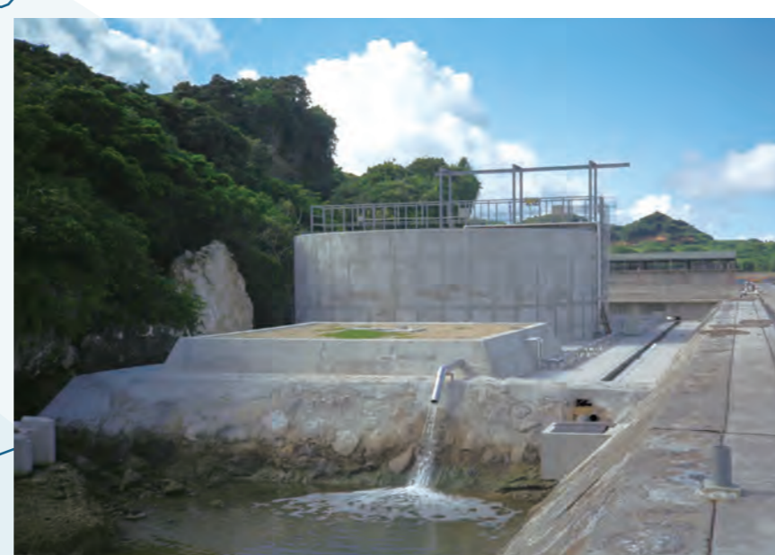
Ishigaki Island, Okinawa