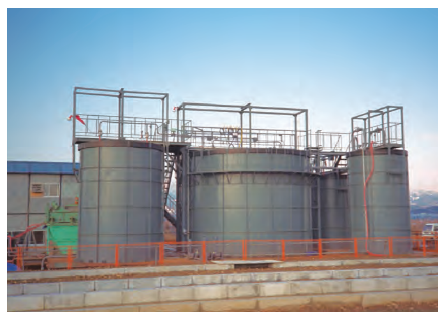
Lake Biwa, Shiga