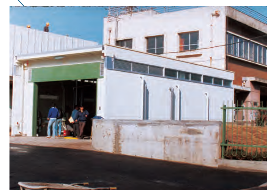
Haneda Airport, Tokyo

for Pollutec Lyon France on 2-5 December, 2014 Copyright (C) 2014 Rural Environment Research Association All Rights Reserved. http://www.rera.org webmaster@rera.org