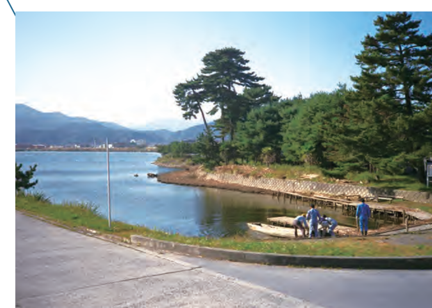
Marsh Furukawa, Iwate